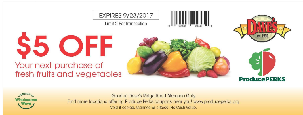
Fig. 1 Produce Perks Pilot Coupon at Dave's Mercado

Produce Perks is Ohio's nutrition incentive program, which seeks to increase access to fresh and healthy food options for families who use Supplemental Nutrition Assistance Program (SNAP/EBT) benefits while also strengthening local farms and economies. Produce Perks matches the value of SNAP benefits when they are spent on fruits and vegetables (e.g., for every $1 in SNAP spent on fruits and vegetables, customers using SNAP/EBT receive an extra $1 to spend on additional produce at both farmers' markets and grocery stores). This pilot was funded by the Ohio Department of Health and implemented by national nonprofit Wholesome Wave with support from the Ohio Grocers Association and the Ohio Nutrition Incentive Network, a multi-sector statewide coalition led by Produce Perks Midwest.