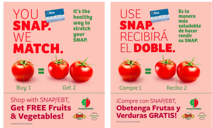
Fig. 2 Bilingual Store Signage Placed in Produce Section and at Registers

Bilingual signage was placed in the store after the second week of the pilot. This signage was posted in the produce section and at store registers to prompt customers to use or ask about the Produce Perks coupon. The language of the sign is consistent with the "You SNAP. We Match." campaign materials distributed statewide. It is meant to convey to customers that if they use their SNAP benefits on fresh produce, they qualify for the Produce Perks incentives. For this pilot, SNAP customers were not required to purchase any fruits and vegetables to qualify for the incentive.